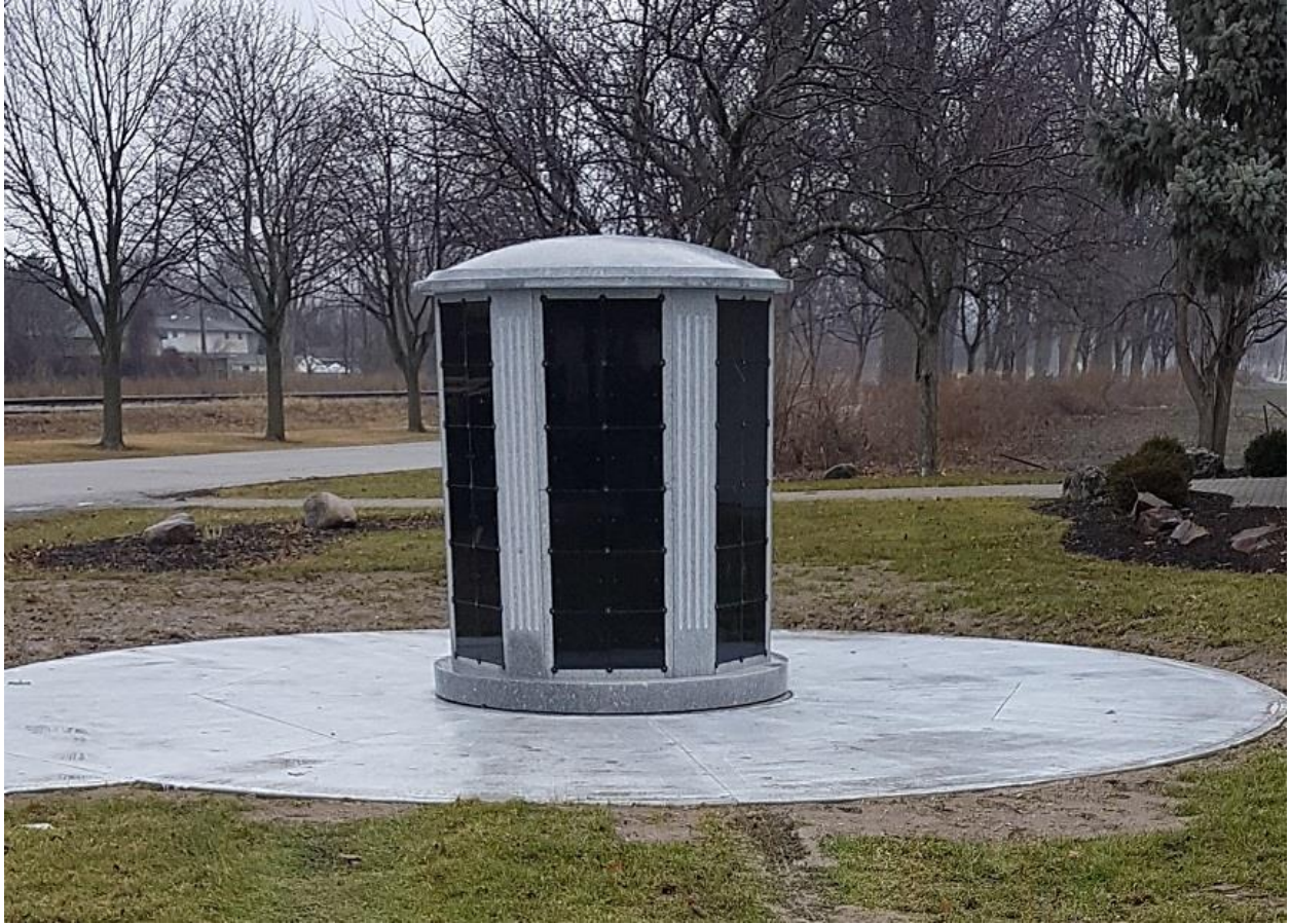
Figure 1: 72-Unit Columbarium with Cement Base