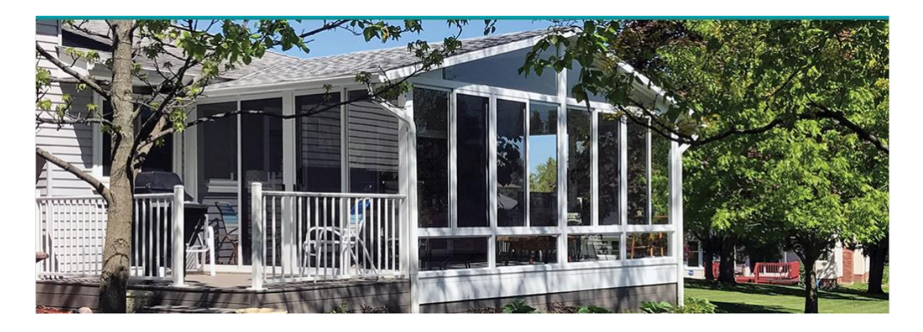
Figure 3. A sunroom