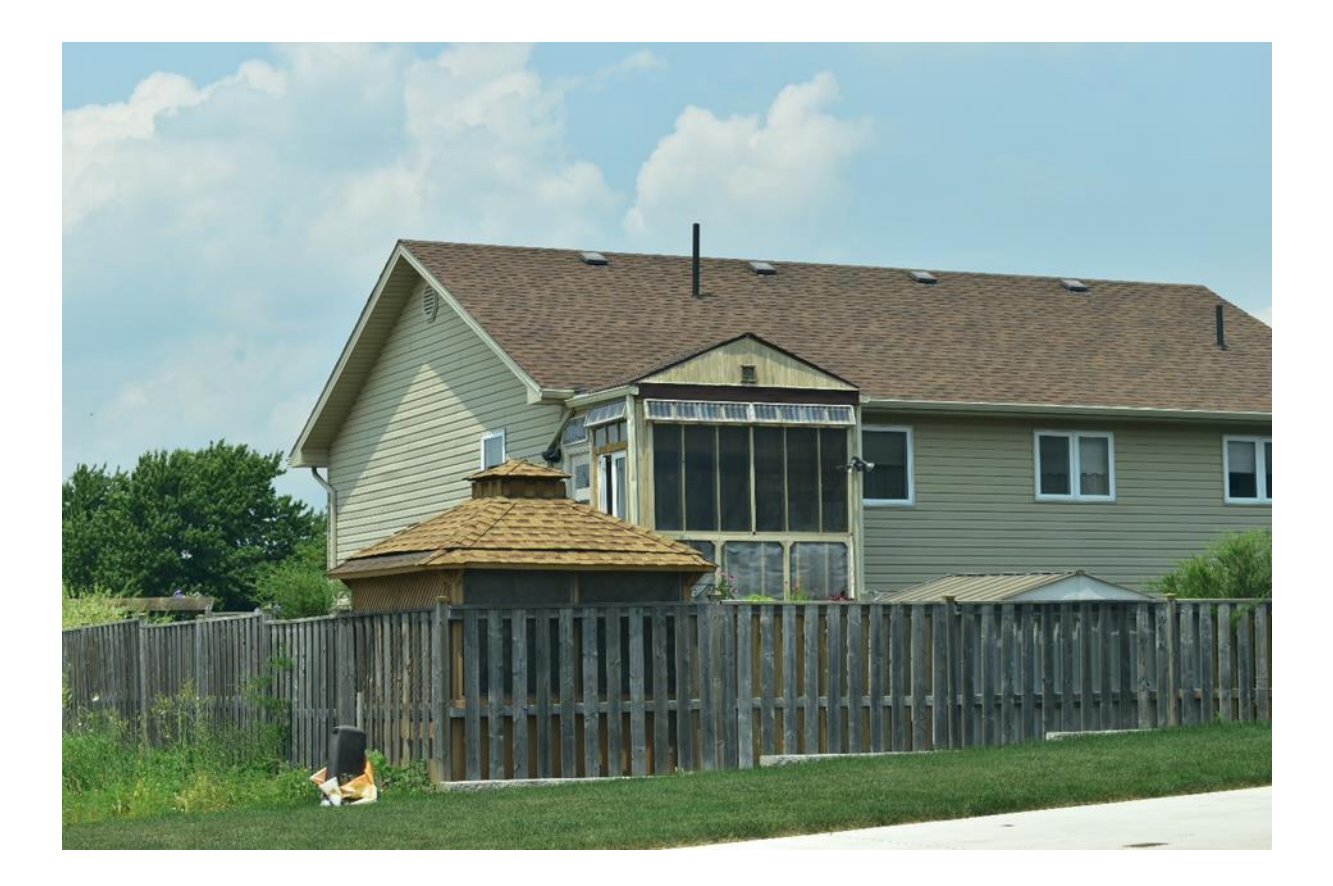
Figure 2. A Porch