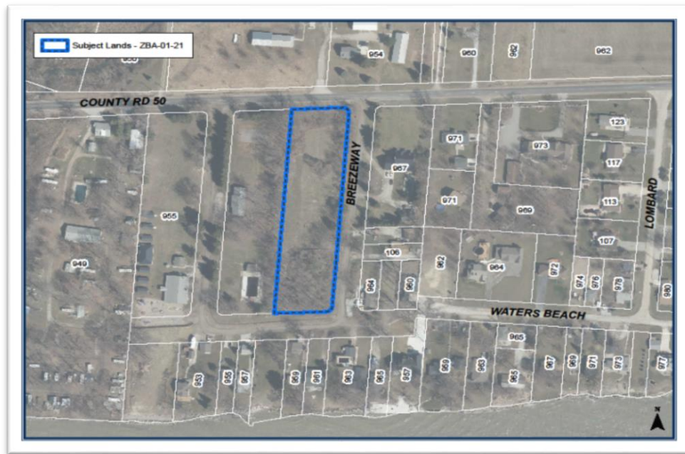
Figure 1. Location Map of Subject Lands

within 120 metres of a natural heritage feature located on the lands to the south (Note: Adjacent lands are defined as lands within 120 metres of a significant natural feature under the Official Plan. In accordance with the Official plan, development and site alteration is not permitted within 120 metres of a significant natural feature unless it has been demonstrated that there will be no negative impact on the feature or their ecologic function).