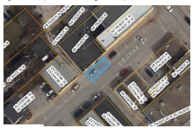
Figure 1: Requested Loading Zone Space (Centre Street)

At the November 16, 2020 Regular Council meeting, the delegate requested that the loading zone be directly adjacent to the St. Vincent de Paul donations drop-off door located at 44 Talbot Street North, off of Centre Street as shown in Figure 1.