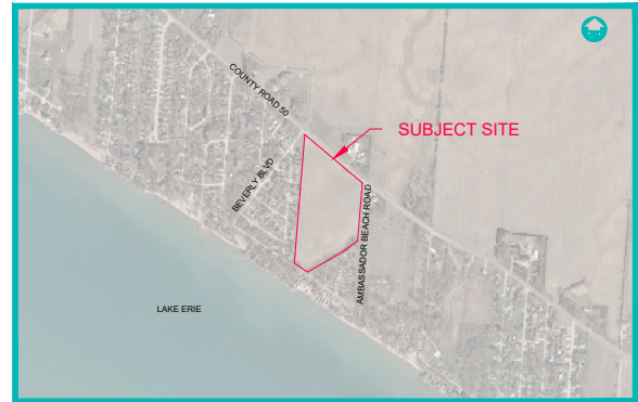
KEY PLAN N.T.S.