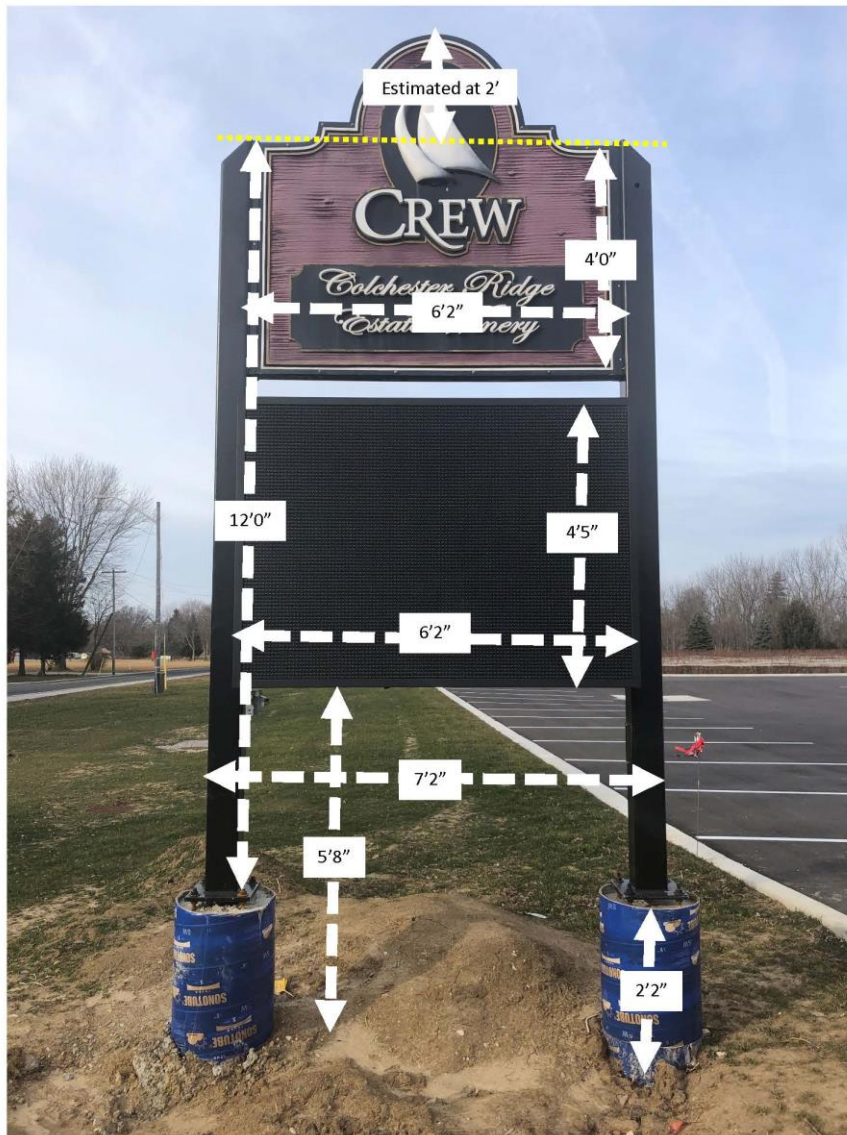
Figure 4. Measurements of new sign structure as submitted by Town of Essex Building Division

Special Regulations for Signs in Agricultural Districts under Bylaw 1350