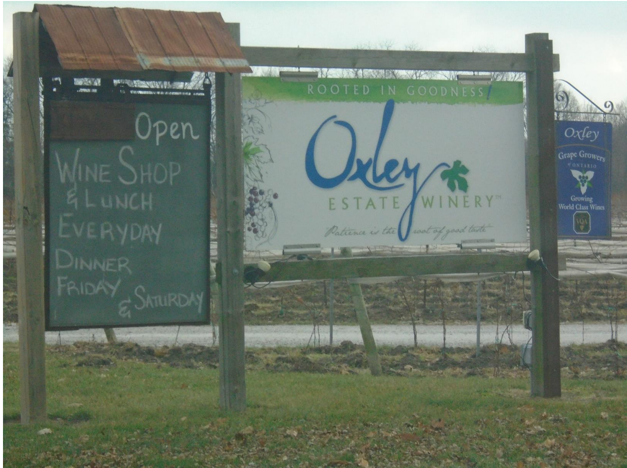
Figure 4. Ground Sign at Oxley Estate Winery