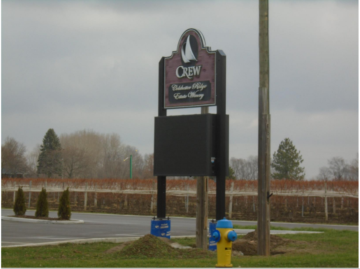
Figure 1. New sign structure with steel posts, logo and electronic media component