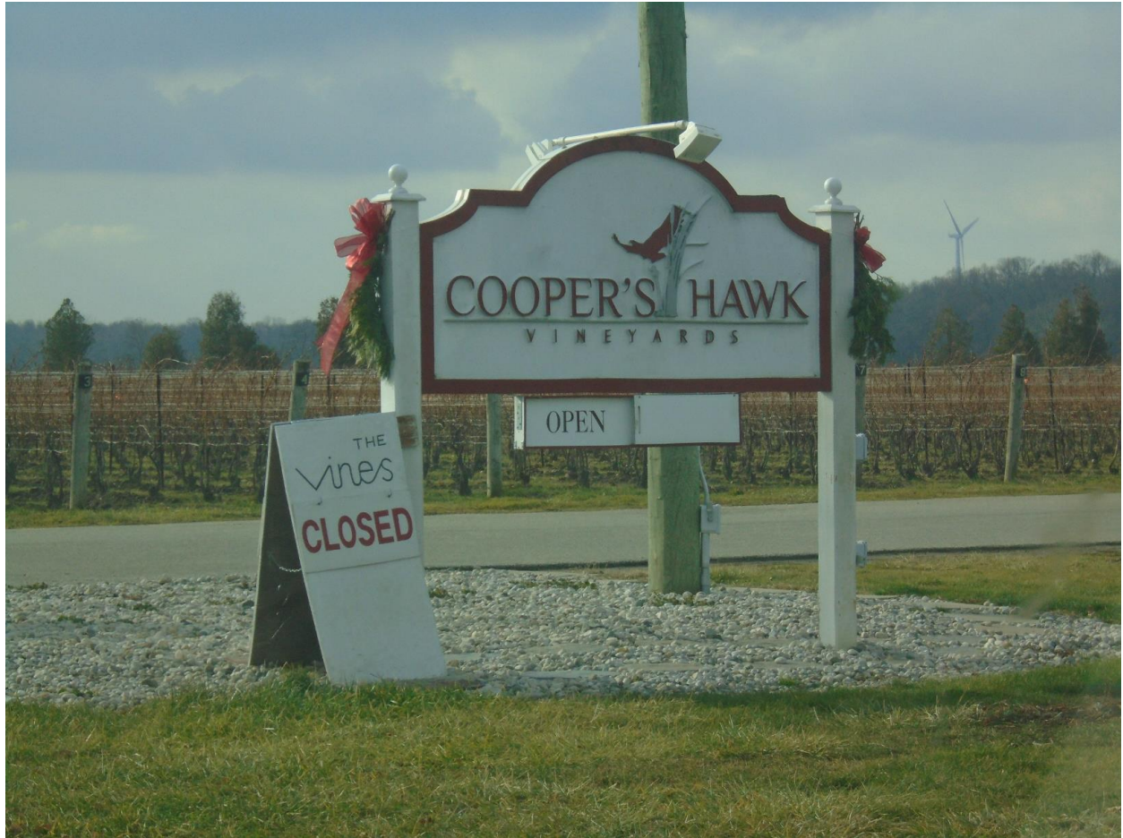
Figure 3. Ground sign at Coopers Hawk Winery