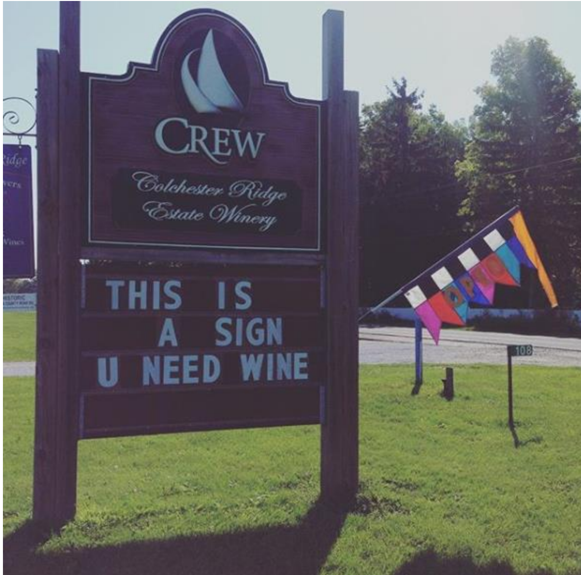
Figure 2. Previous sign structure with wood posts, logo and letter board