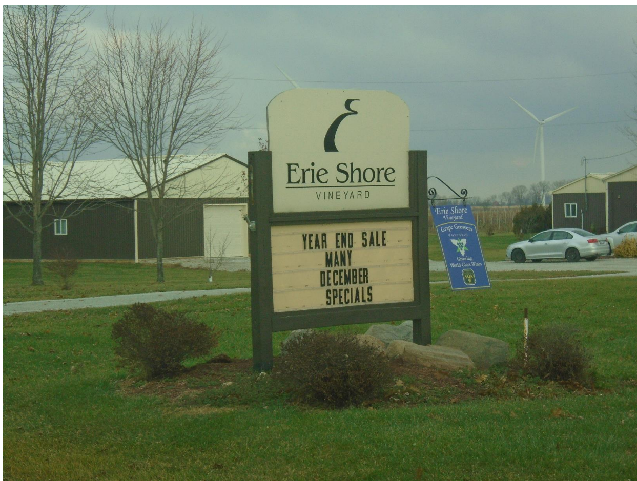
Figure 5. Ground Sign at Erie Shore Vineyard