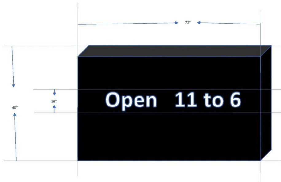
Figure 2. Electronic component proposed to be utilized for static message

On July 23, 2020, Mr. Gorski submitted a revised application to remove the electronic media component of the sign but retain the pole sign structure. The electronic component was proposed to be utilized for the display of a static message, as identified in Figure 2 . Council deferred the application at their regular meeting on August 4, 2020, upon the request of Mr. Gorski who wished to present a further amended proposal to appease the concerns of residents and Council, and better align with the intentions of the sign bylaw for non-residential uses within agricultural districts along County Road 50. A copy of Planning report PLANNING2020-18 is attached to this report.