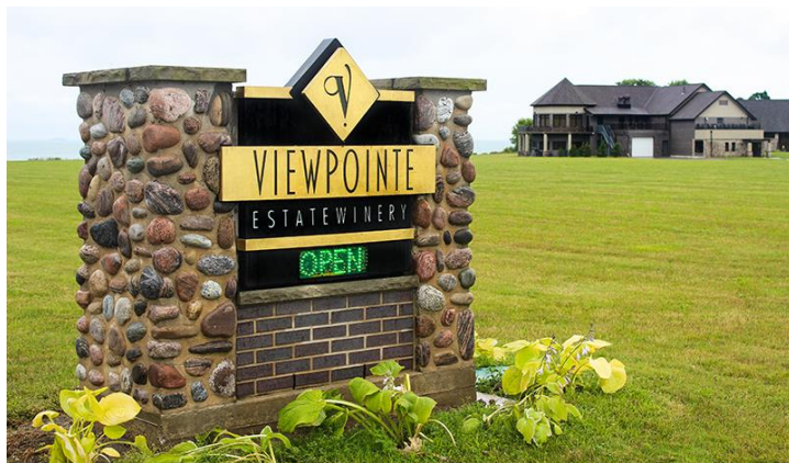
Figure 5. Lighted Sign at Viewpoint Winery

Lighted signs are signs which are lit either internally or externally to enhance the visibility of the sign. Examples of lighted signs exist in the commercial district and agricultural districts. One such example is the Viewpoint Winery sign identified in Figure 5 . Although the intention of Bylaw 1350 was to clearly permit lighted signs in agricultural districts, upon further review of the Bylaw, it was noted that reference to lighted signs are absent from any land use district in the Bylaw and are therefore, not explicitly permitted nor prohibited in the Agricultural district. (Administration will be proposing a general amendment to Bylaw 1350 in the future to correct this omission and explicitly recognize lighted signs in various districts).