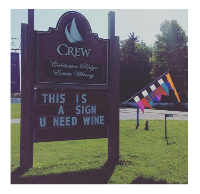
Figure 3. Previous sign structure constructed in 2005.