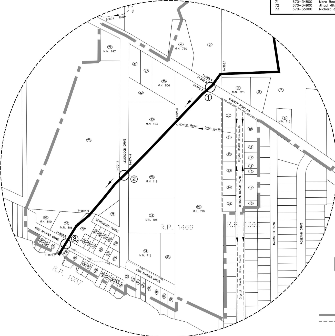
BLOW UP DETAIL 'A'