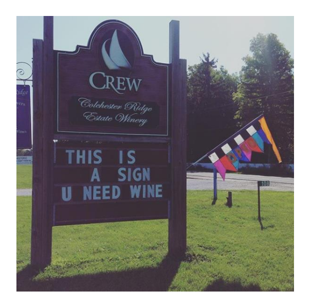
Figure 3. Previous sign structure constructed in 2005.

For a non-residential use in an Agricultural District, such as a winery, Town of Essex Sign Bylaw, By-law 1350, permits one (1) on-site ground sign having a maximum height of 2.0 metres (6.5 feet).